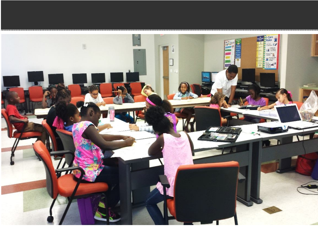
KIDS HARD AT WORK!